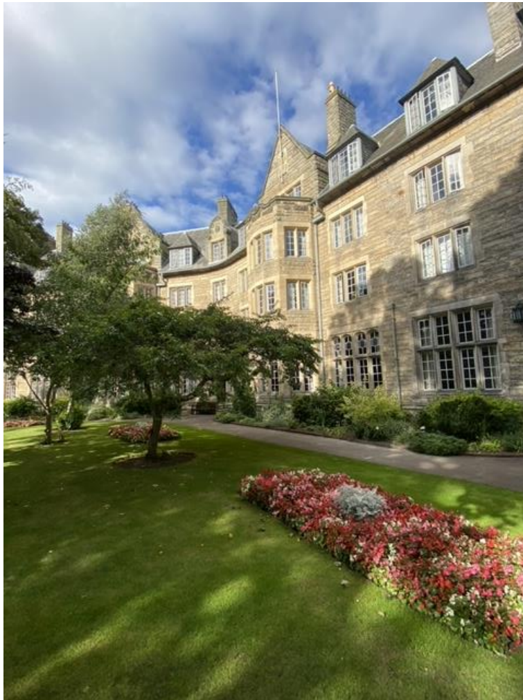
St Salvator's Hall

My accommodation from a different angle.