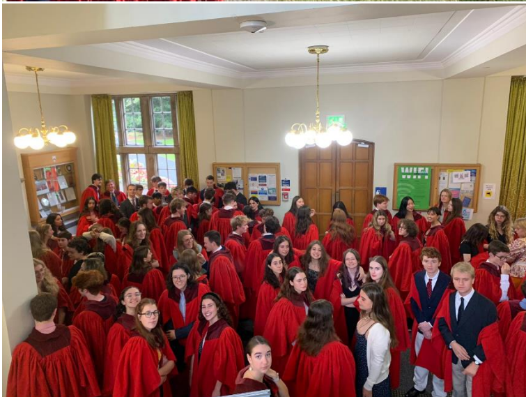
St Salvator's Hall entrance hall

Preparation for the Hall photo, which is taken once a semester in all Halls and hung in the Common Room as a memento for the students.