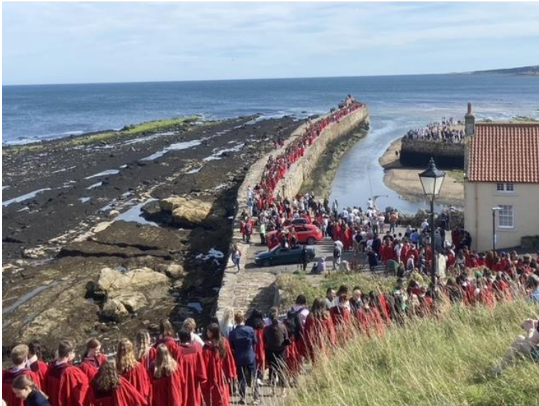
St Andrews Pier

St Andrews' central shopping street with the Whyte-Melville Memorial Fountain in the foreground.